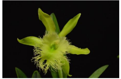
Species: digbyana E Linderberg