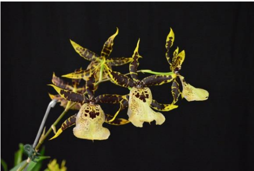
Any Other. Algra. Flying High 'Stars & Bars'