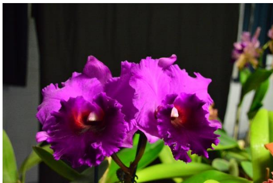
Judges Choice: Blc. Burdiken Delight X Blc. Canyon Dusk