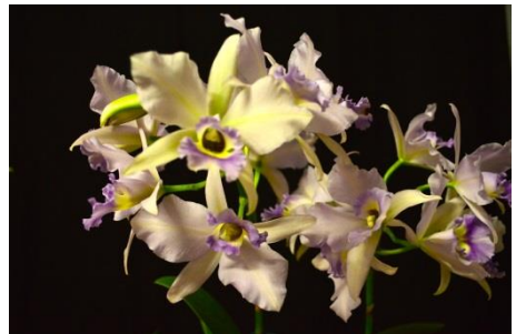
Novice. Rlc .Living Treasure 'Erin Gold'