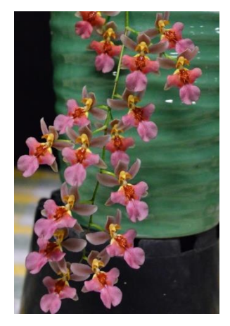
Onc . Possum Woolf C G Symonds