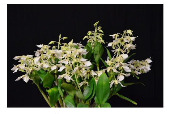
Den .Roy Tokunaga C & E Linderberg