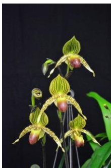
Phap: Prime Child C Trudgan