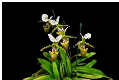
Phap: spicerianum A & B Heidke