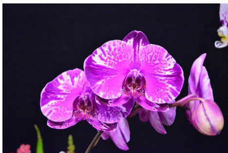
Phal: Reuy Lih Queen R Emerson