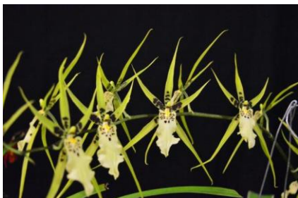
Brsdm: Guided Urchin E Linderberg