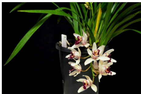
Cym: Show Girl W & G Sergeant