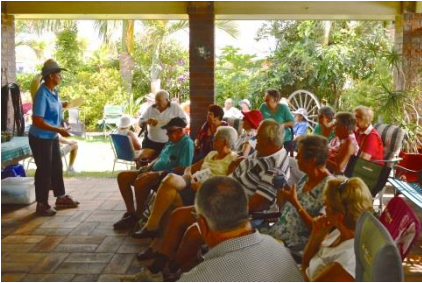
This was an 'interested' growers group