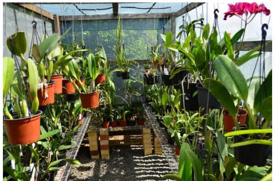
Things that one doesn't notice on a daily basis in their own Orchid house.