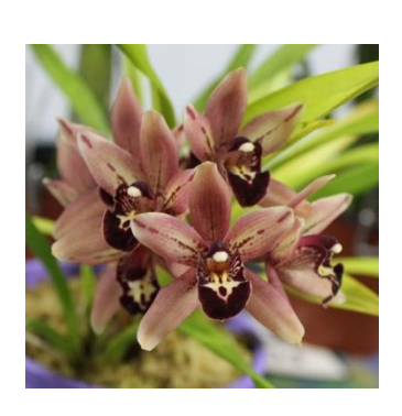
Cym Cherry Kisses