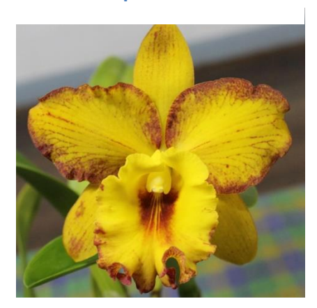
Ric Fortunes Flow x Arabesque