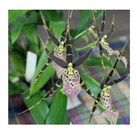
MTSSA Sheldb 'Tolken'