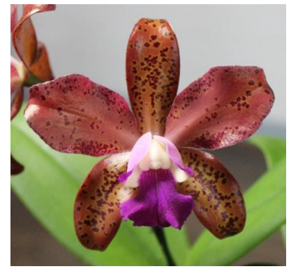
Catteleya Decption Drop