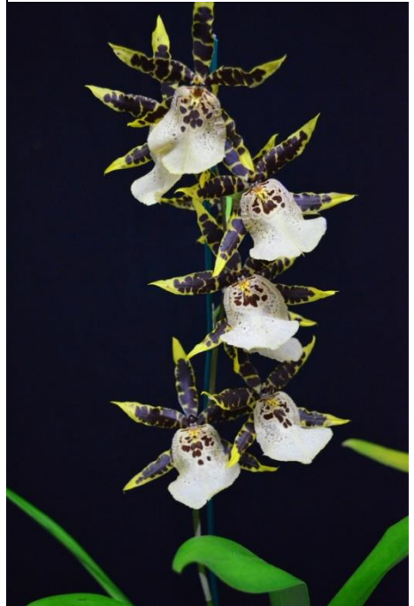
Dgma. Flying High