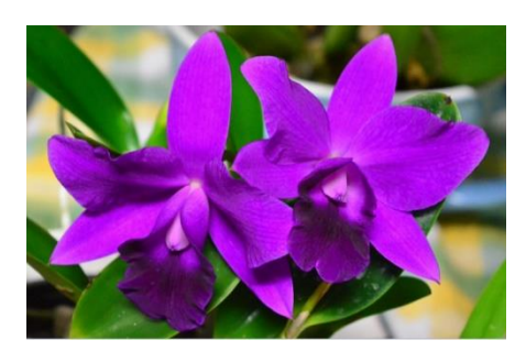
Lc. Mini Purple