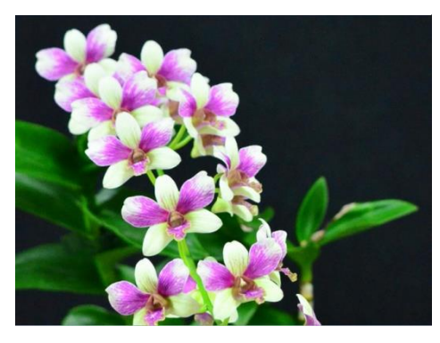
Den. Triple Fantasy