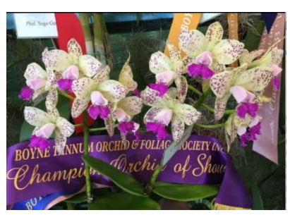
C. Jungle Queen