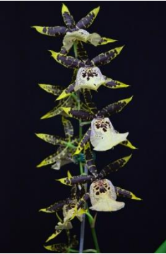
Alcera Flying High