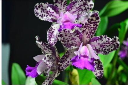
C.lumita x C. Lulu