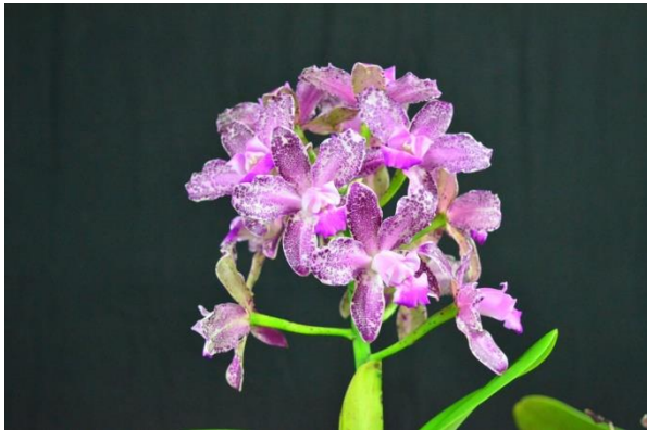
C.Caudebex x C.Lulu