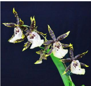
Dgma. Flying High