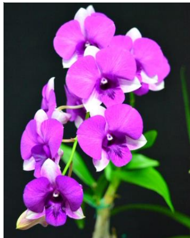
Den. Pink Butterfly