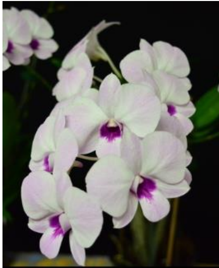
Den. Chao Prays Sweet