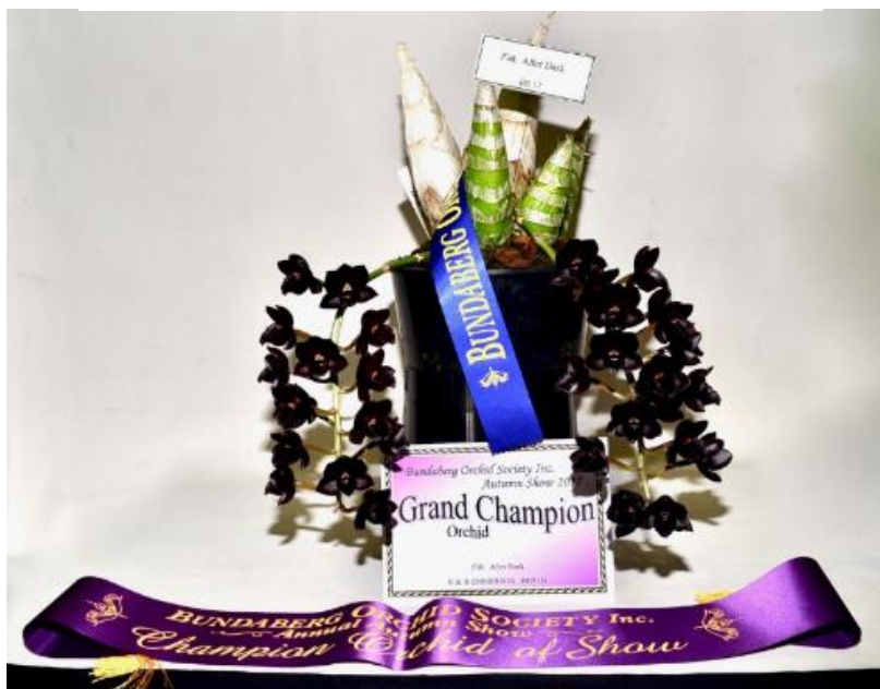
Fdk. After Dark