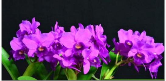
Ctt. Little Susie