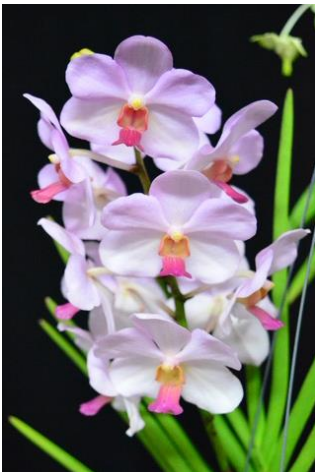
Vct. South East Pearl