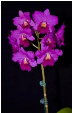
Cltra Rosy Jewel