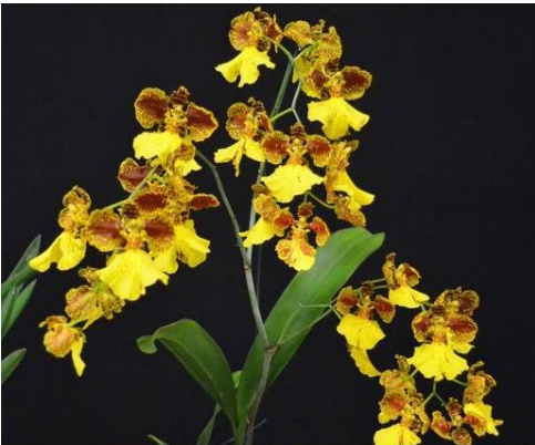
Hwra. Chian Tzy Lovely x Moon Beaty