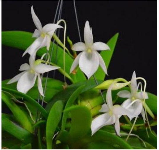
Angraecum Leonis "Comoro"