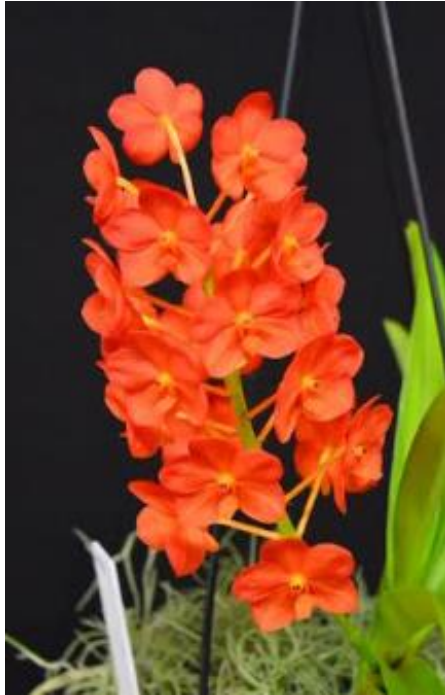
V. Banghuntingian Gold X V. miniata