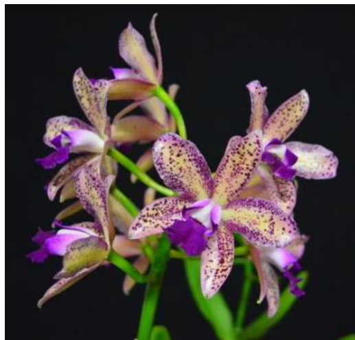
C. Deception Dots