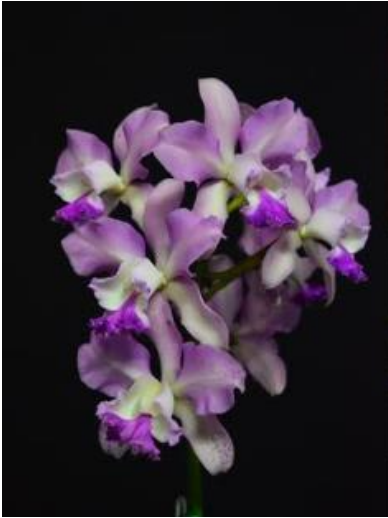
Angel Heart 'Hihimanu' x Caudebec Southern Cross