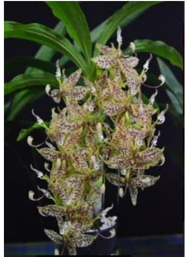
Cyn. Jumbo Cooper x Cyn pentadactylon