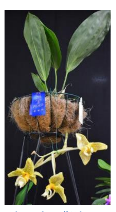
Staun Greenii X Staun Assidensis