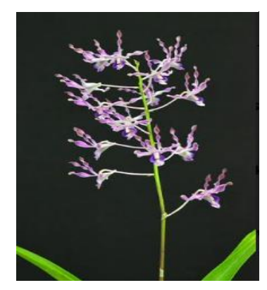
Den. Blue Sparkle