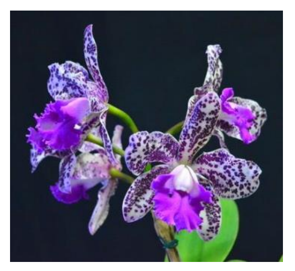
Deception Drop Dark Desire