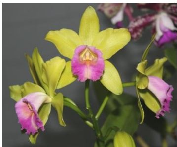
Rlc. Hawaiian Passion