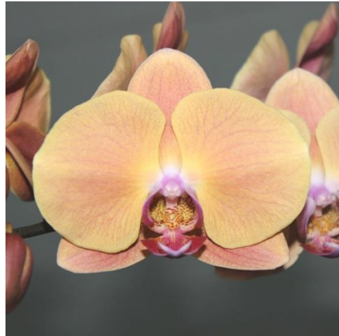
Phal. OX Golden Apple