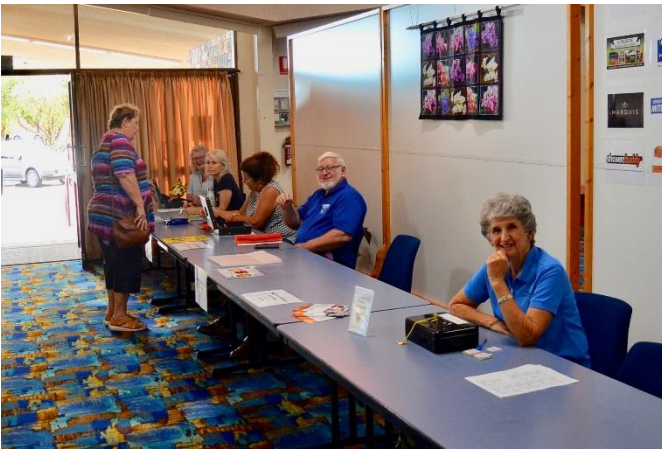
Front Entry, Raffles Sales and Posy Sales