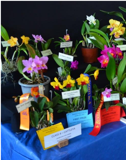
Class 4 – Cattleya – Sponsored by Auswide Bank