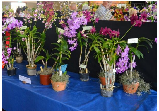
Class 15 – Dendrobium – Sponsored by Red Rooster