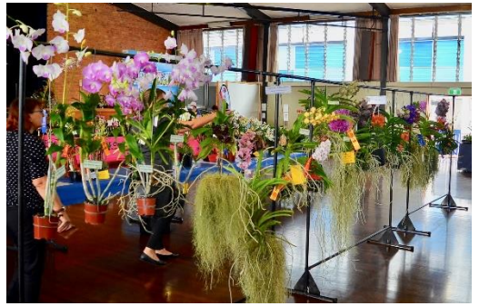
Class 30-31 – Vanda – Sponsored by Hervey Bay Orchid House