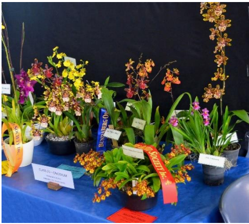
Class 25 – Oncidium – Sponsored by North Bundy Vet Clinic