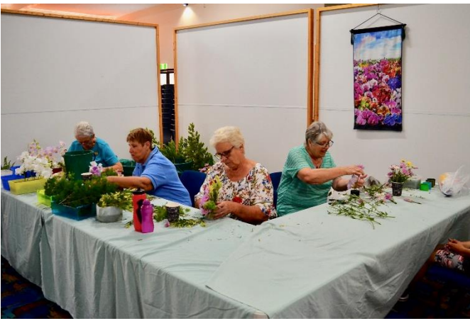
Posy making ladies hard at work