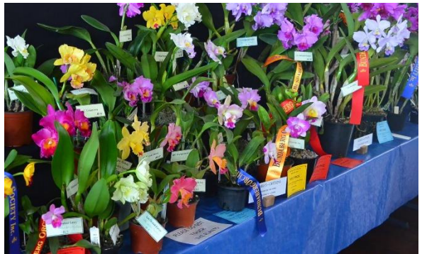
Class 5 – Cattleya – Sponsored by Auswide Bank