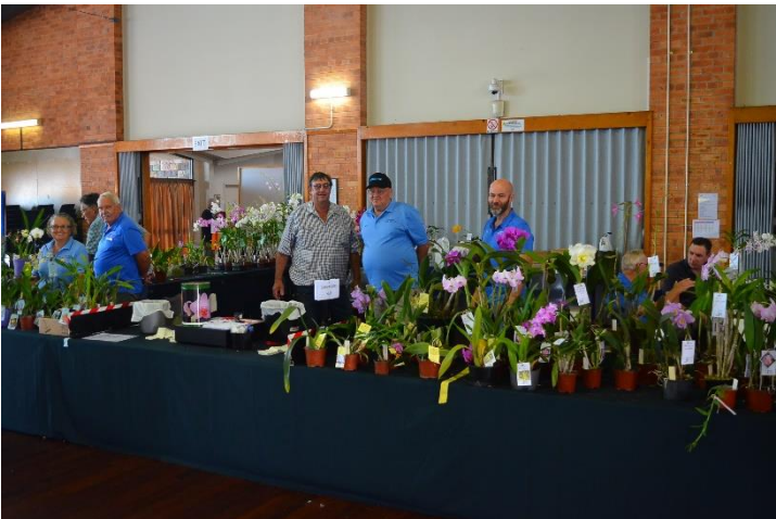
BOSI Orchid Sales Area