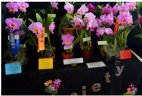
Class 2 – Cattleya – Sponsored by Auswide Bank