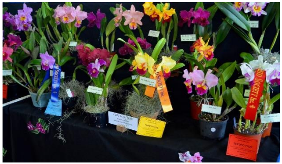
Class 3 – Cattleya – Sponsored by Auswide Bank