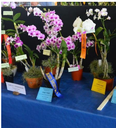
Class 13 – Dendrobium – Sponsored by Takalvans