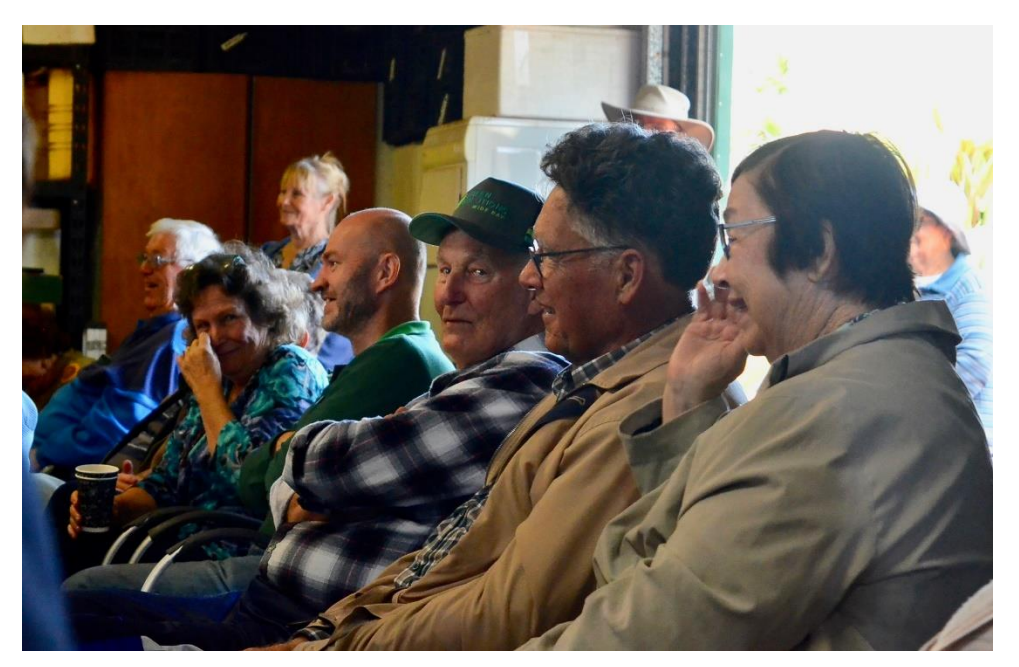
The usual Suspects