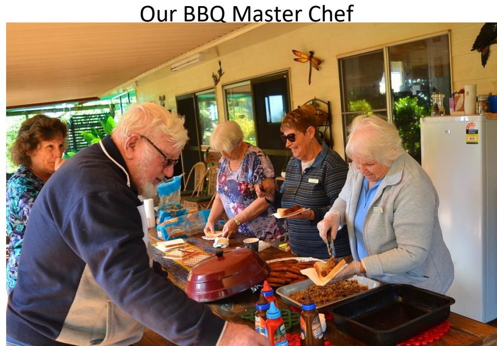
Looks magnificent ladies – who does not love a good sausage sizzle