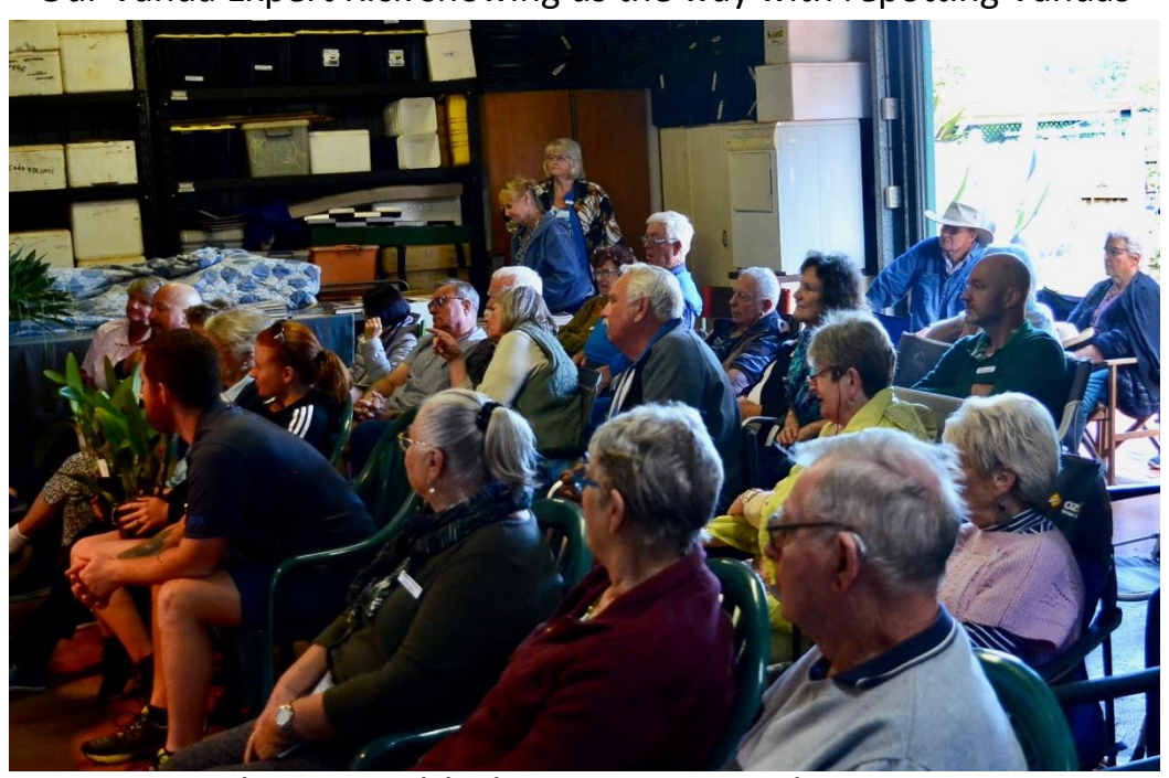
The assembled very interested masses