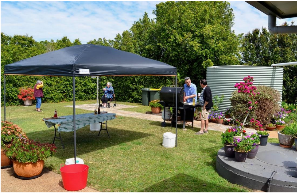
The BBQ on the go