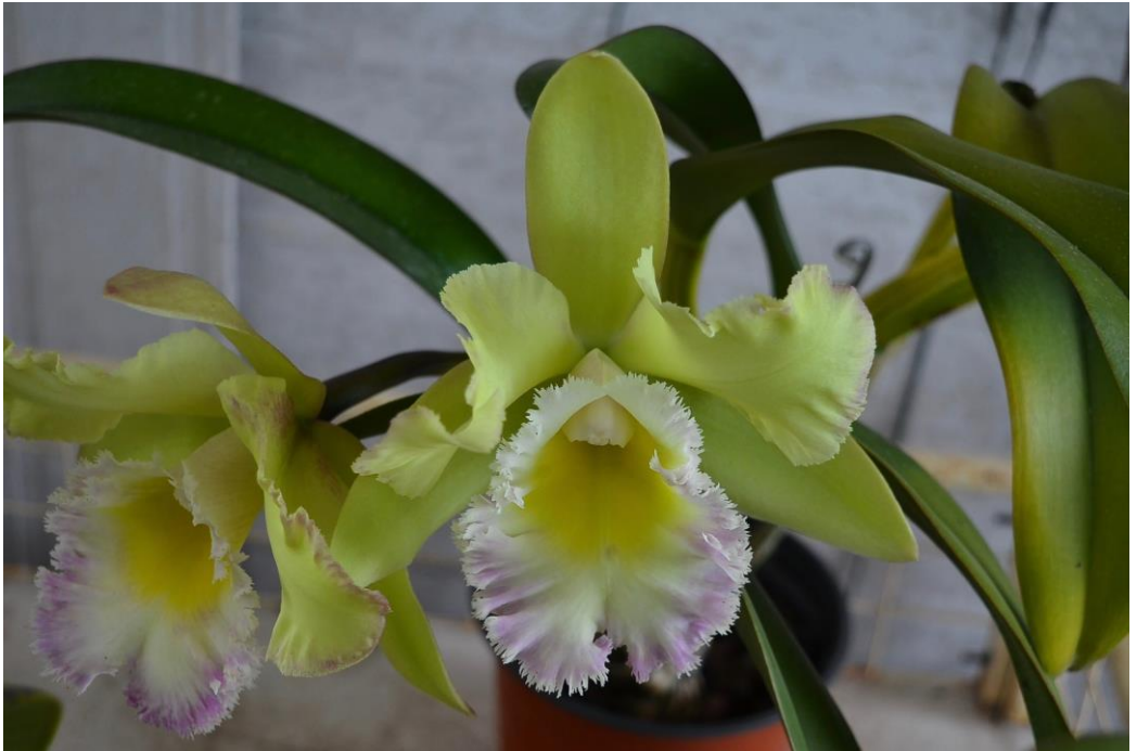
Some of the Schouten's good looking Cattleyas