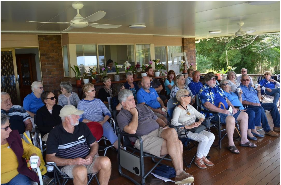
The very attentive audience