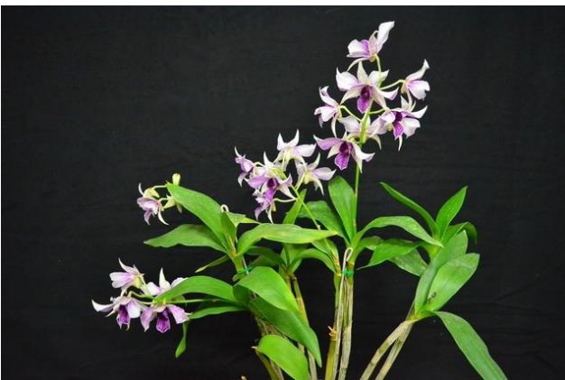
Dendrobium Winner & Popular Vote Fire Wings A&B Heidke