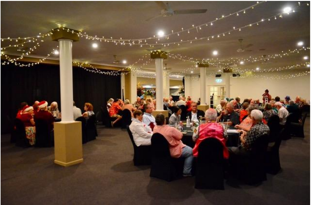
Some of the assebled masses