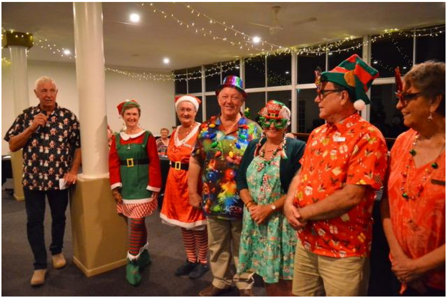
Finalists in the Christmas Dress Up Competition