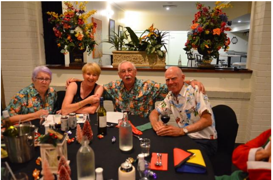
Some happy campers mooching free accomodation on the Sunny Coast