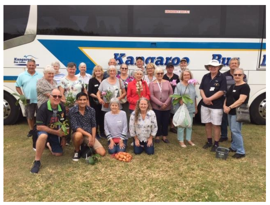
Most of the visitors from Noosa