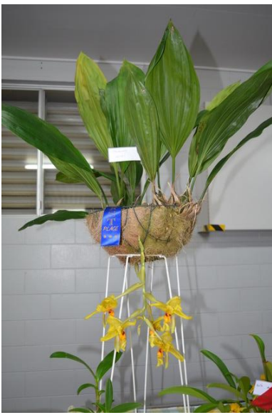
Species Winner & Popular Vote Stenhopaea Wardii