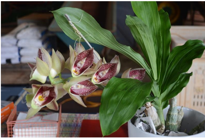
A very interesting Orchid