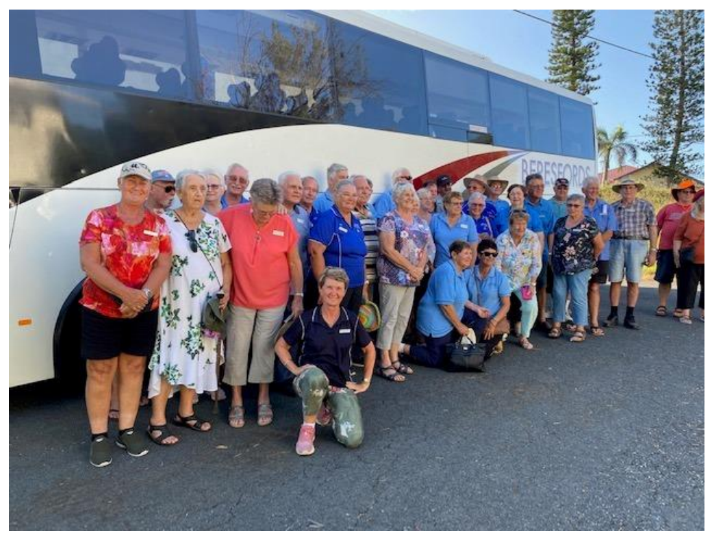
The Participants (good looking Bunch Eh!)