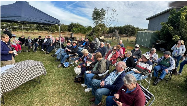
The assembled Masses