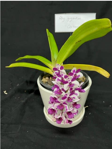
Species Popular Vote Winner Rhy. gigantea