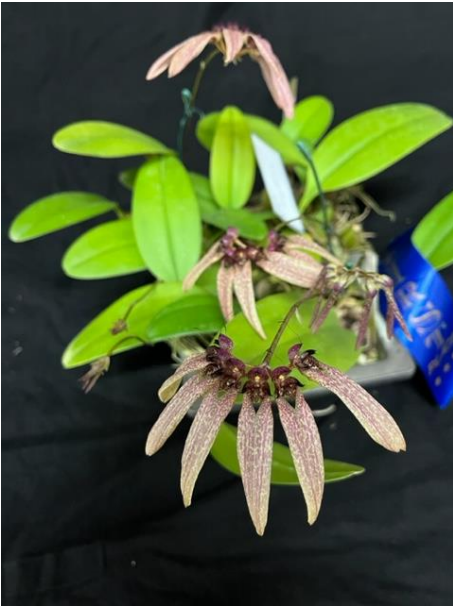
Species Winner Bulb. longiflorum