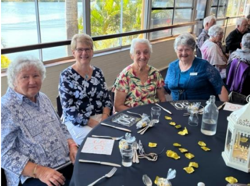
Some of the club's movers and shakers