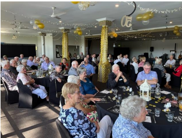
It was a great turnout of members and guests