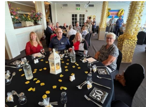
Our visitors (centre) from Maryborough Orchid Society