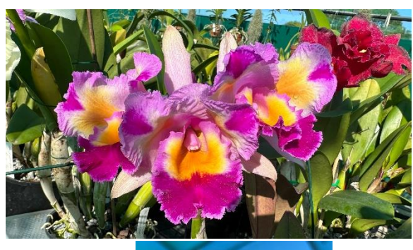
Some of Dale and Di's great looking Orchids