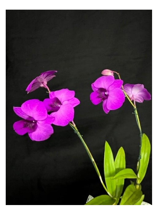
Dendrobium & Popular Vote Winner Den. Rum City Dragon