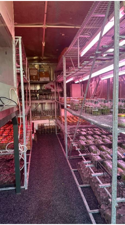
Rick has a couple of flasks