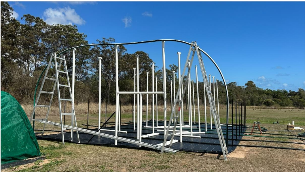
Also expanding his business – Pacific Beach Orchids