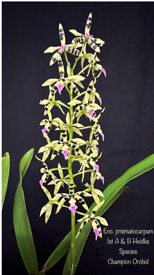
Enc. prismatocarpum 1st A & B Heidke Species Champion Orchid