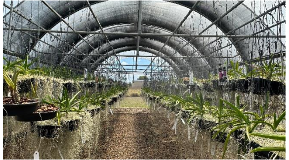
And a couple of Vandas