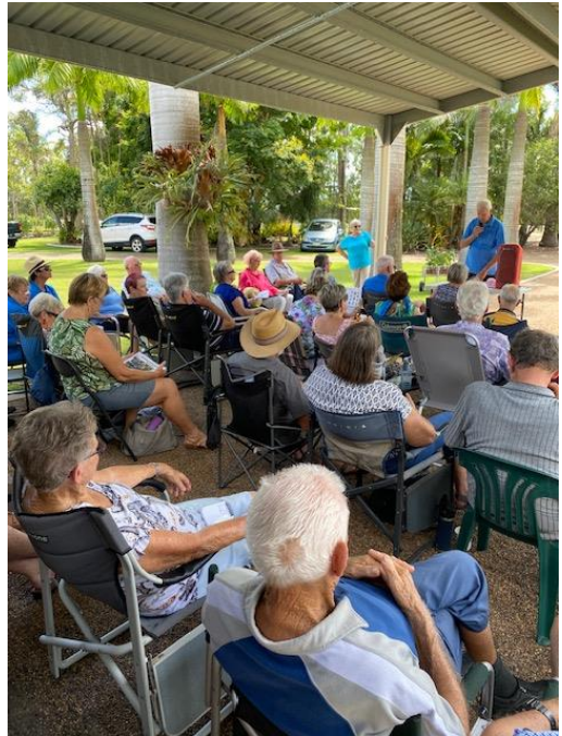
Some of the attendees