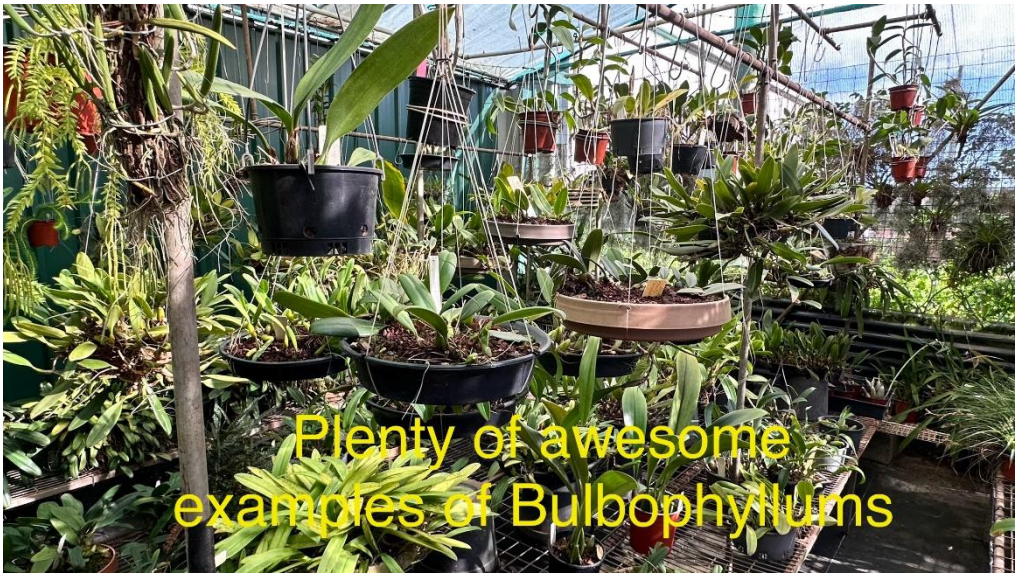
Plenty of awesome examples of Bulbophyllums