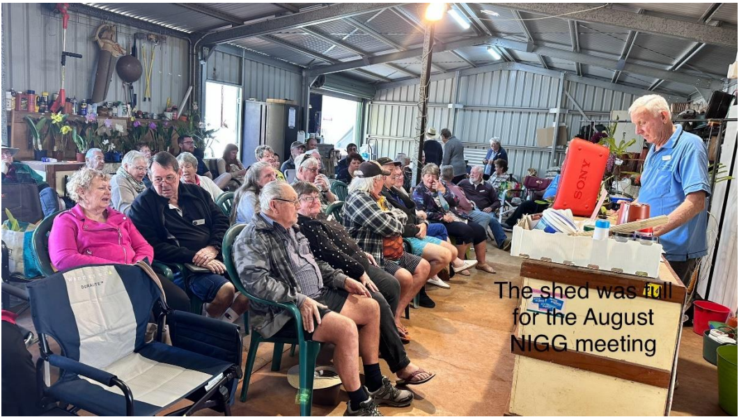
The shed was full for the August NIGG meeting