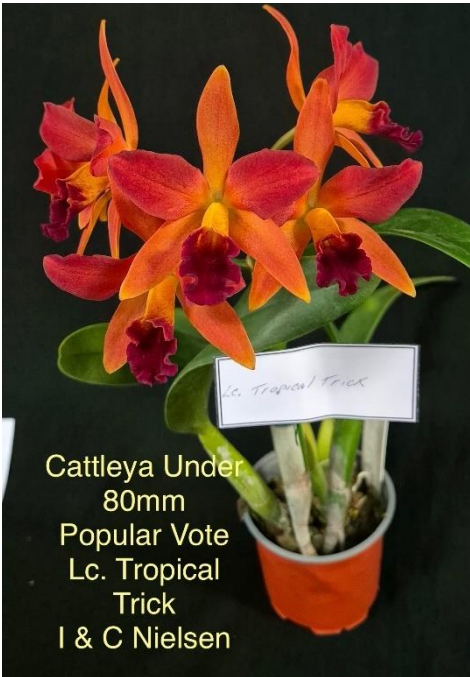
Cattleya Under 80mm Popular Vote Lc. Tropical Trick I & C Nielsen