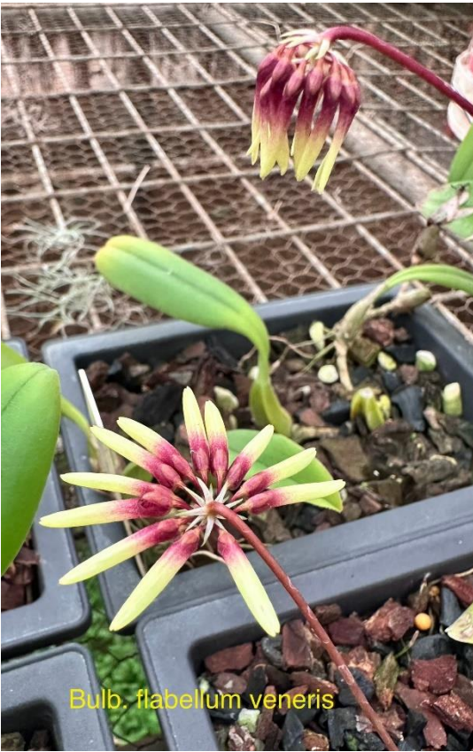
Bulb. flabelium veneris