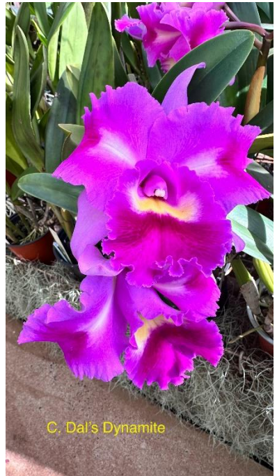
C. Dal's Dynamite