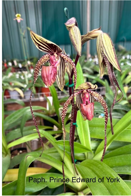
Paph. Prince Edward of York