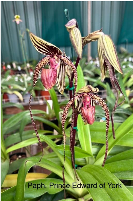
Paph. Prince Edward of York